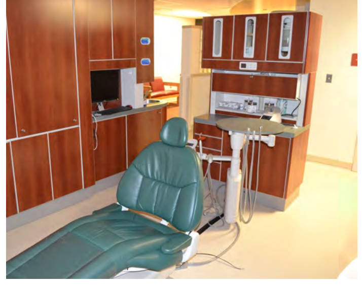
How is Charlotte Hall Veterans Home different from other nursing home or assisted living facilities?

The VA provides a daily per diem toward the cost of care for each veteran. The daily per diem rates as of October 1, 2015 are: $103.61 per day for Nursing Home Care = $3,108.03 per month savings $44.72 per day for Assisted Living Care = $1,341.60 per month savings VP1-70% or greater service connected veteran may be entitled to the full cost of nursing home care = $7,700 per month or greater savings On-site veteran benefits specialist to assist eligible residents