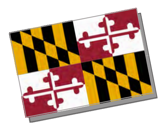
MARYLAND THANKS OUR VETERANS AND FAMILIES FOR THEIR SERVICE TO OUR STATE AND NATION